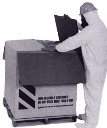
Step 8: Carefully compress the bag of waste into the container and close the flaps.