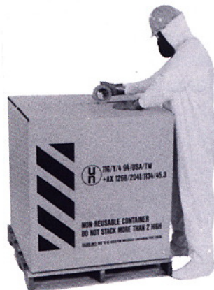
Step 9: Seal the container permanently with an appropriate heavy-duty tape (2" pressure-sensitive poly tape or equivalent minimum).

Note: Personal protective equipment used will be contingent upon the site, safety and health plan at your company. Consult the safety supervisor at your company for instructions on handling hazardous waste.