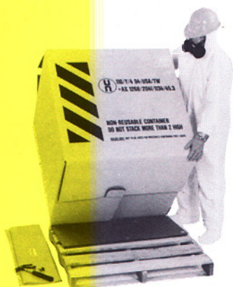
Step 4: Pull container upright onto the pallet.