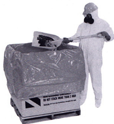
Step 6: Fill the container (bag) with the hazardous waste material.