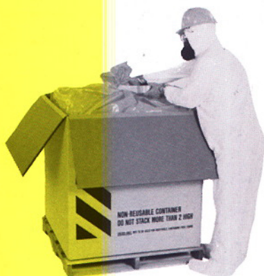
Step 7: Twist the bag closed tightly to secure the hazardous material and seal the bag with an appropriate heavy-duty tape (2" pressure-sensitive poly tape or equivalent minimum) or twist tie.