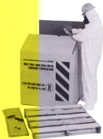
Step 1: Fold top flaps in, turn container upside down, and fold bottom flaps per instructions provided.