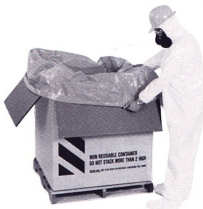
Step 5: Insert the special poly liner bag and stretch around the container walls until firmly in place.