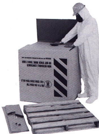
Step 2: Lock die cut bottom flaps leaving one bottom flap unsecured.